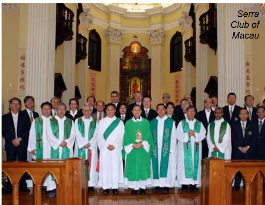
Serra Club of Macau